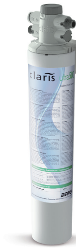
Head sold separately.

Claris Ultra 500-M Filter Cartridge: EV4339-81